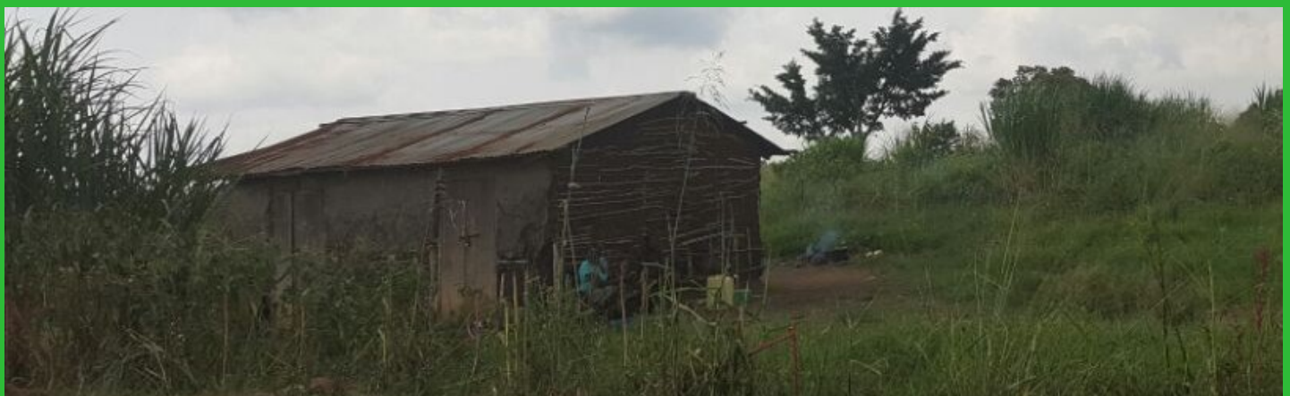
One of the remaining houses in the refinery area surrounded by a thick bush

"Some people who were given compensation money blew it up very fast and are now staying on the periphery of the proposed refinery area. When the government allowed those who are yet to be resettled to grow crops, the other people also started coming slowly and they have established gardens. If the construction of the refinery delays further, more and more of these people are going to come back into their former lands and sending them away later will be a big problem," the officer said.