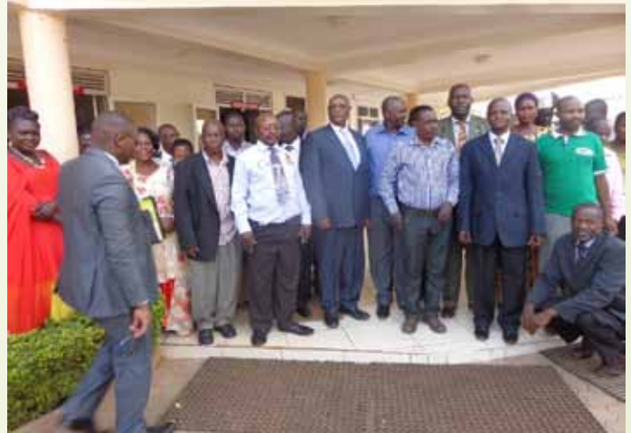
The King of Bunyoro poses for a group photo after the workshop on food sovereignty at Hoima Resort Hotel