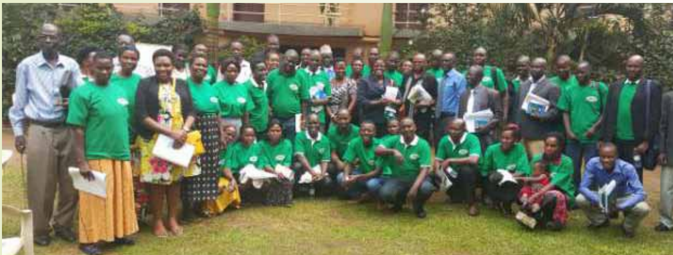
Most Sustainability School activists have registered to be full members of NAPE as seen in this photo taken at the AGM of 2014