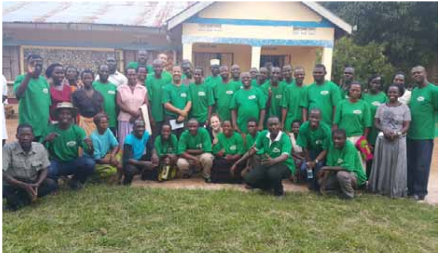
In solidarity: FoE members pose for a photo with representatives of the oil host communities in Butimba, Kizirafumbi sub-county, Hoima District

The FoE members focus on challenging the current model of economic and corporate globalization, and promote solutions that will help to create environmentally sustainable and socially just societies. NAPE is a member of FoE and it is also known as Friends of the Earth-Uganda.