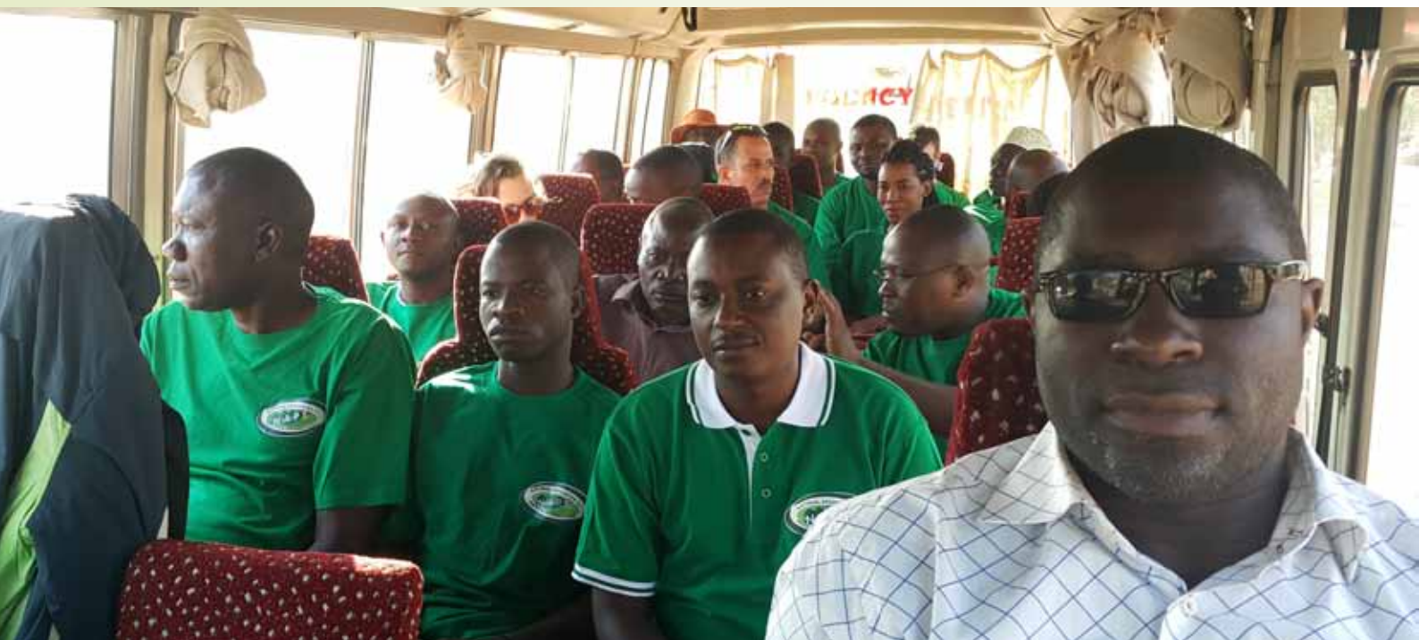
Friends of the Earth activists enjoy a bus ride on the way to the oil region in Western Uganda recently