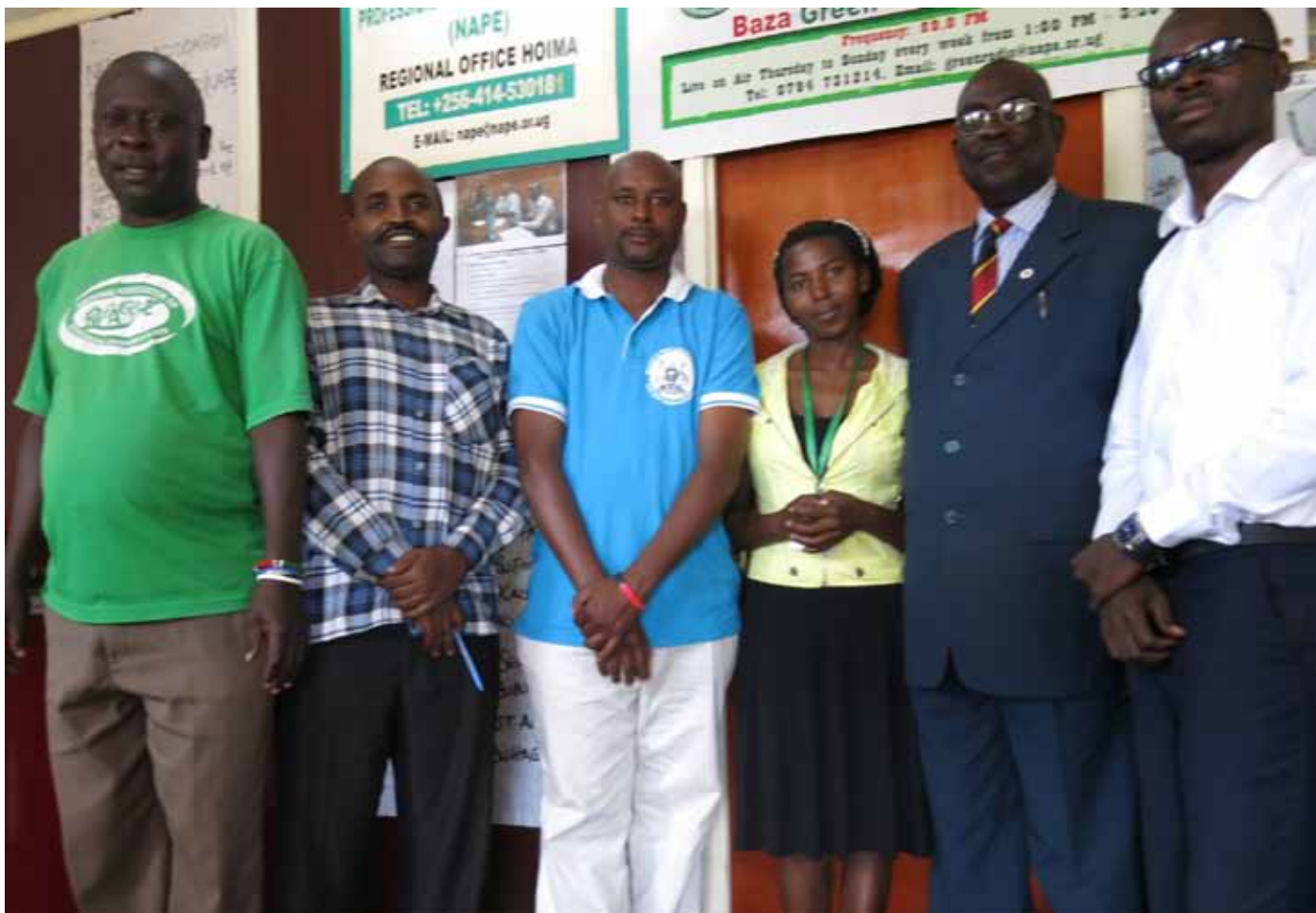
The Premier of Bunyoro (2nd R) with staff of the Community Green Radio at their offices in Hoima