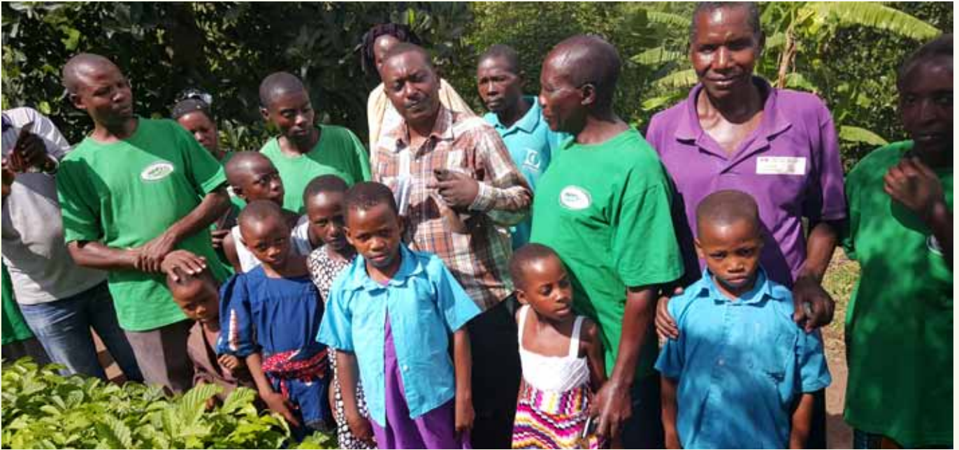
At the new Sustainability village of Kigaaga in Hoima District which neighbours the area designated for the Oil refinery, community members have embarked on a tree planting campaign to keep their air fresh. For continuity purposes, even young school going children are participating in the tree planting exercises. Photo taken at their nursery bed recently