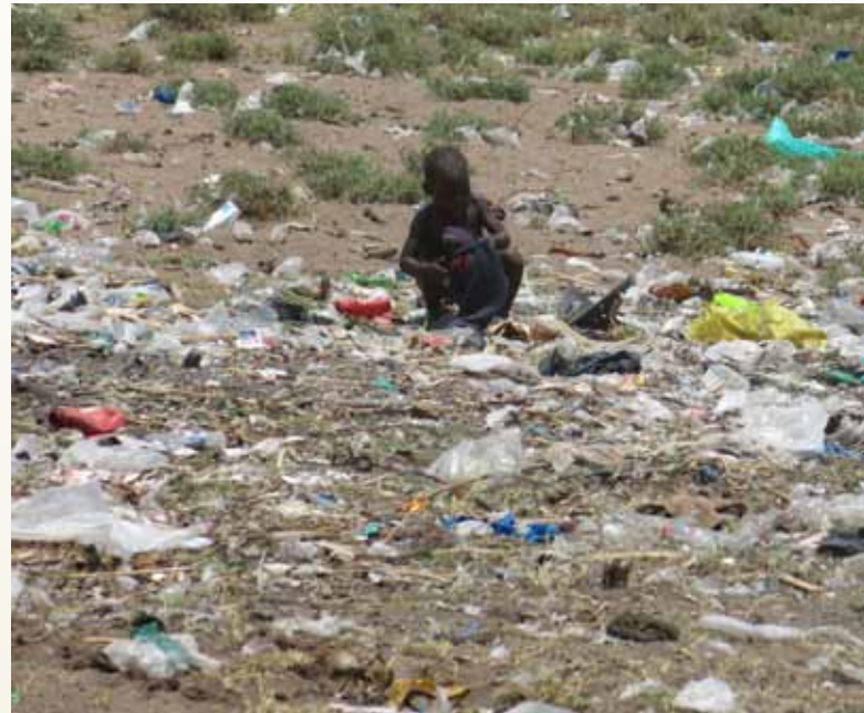
Kaveera poorly disposed in Kijangi landing site in Buseruka Sub County in Hoima District

landfills hold them indefinitely as part of the plastic waste problem throughout the globe.