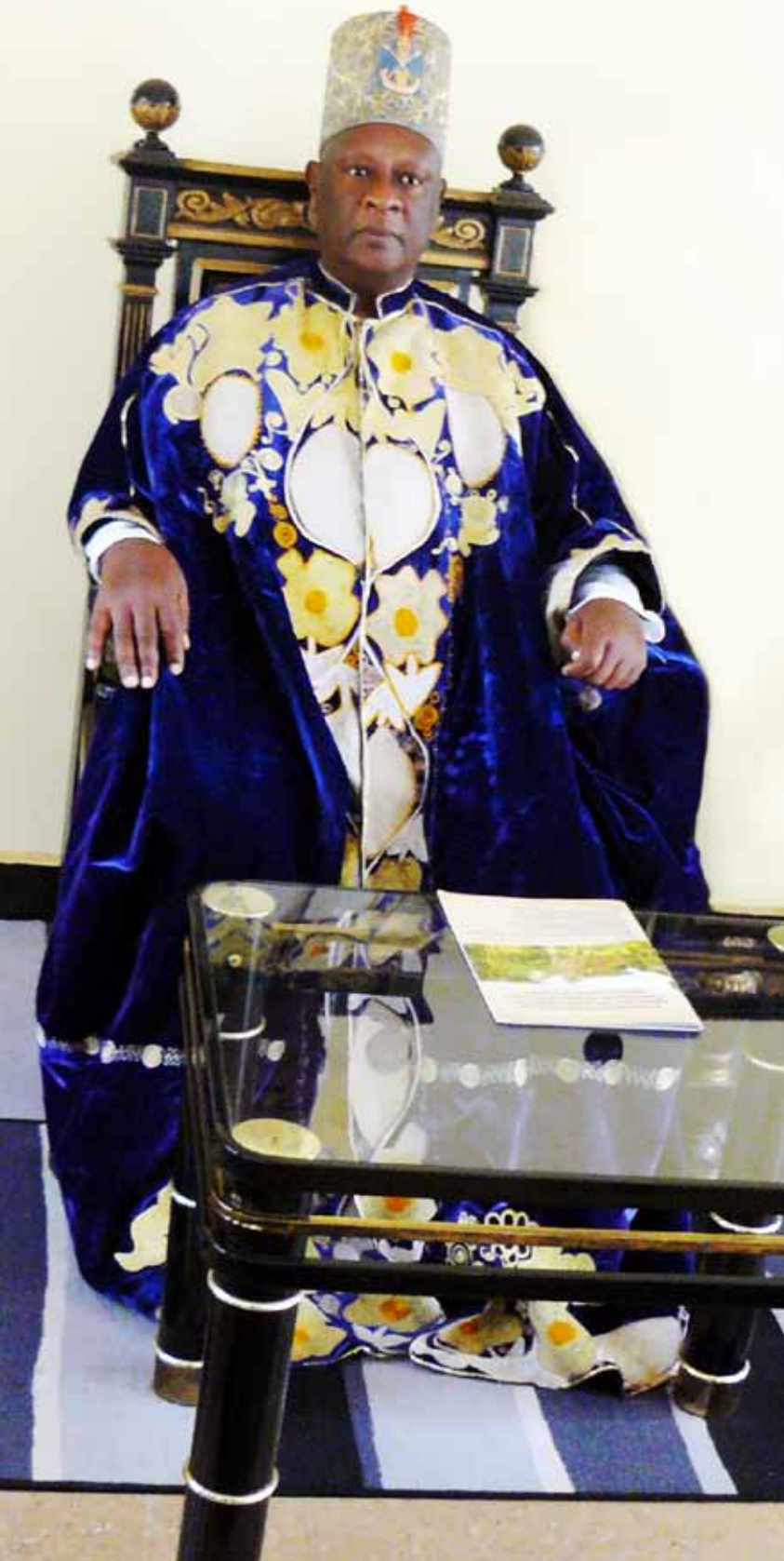
His Majesty Omukama Iguru Gafabusa