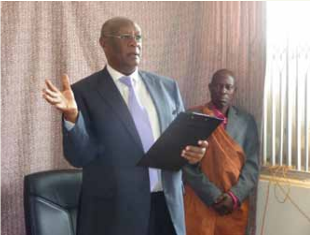
The King of Bunyoro speaking at a workshop on Food sovereignty organized by NAPE in February, 2015