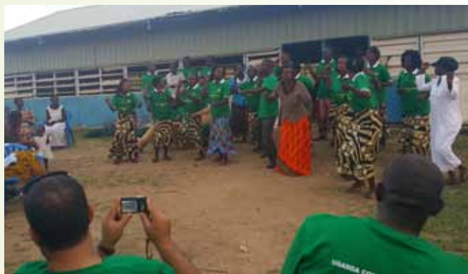
The drama group of Kaiso-Tonya Sustainability village on the shores of Lake Albert entertain visitors from Friends of the Earth on their visit to the area recently.