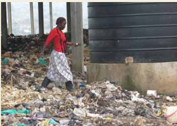
Disposed buveera at Kibati compost site in Hoima district

The biggest problem is that once soiled, they end up in the trash, which then ends up in the landfill or burned. Either solution is very bad for the environment. Burning emits toxic gases that harm the atmosphere while