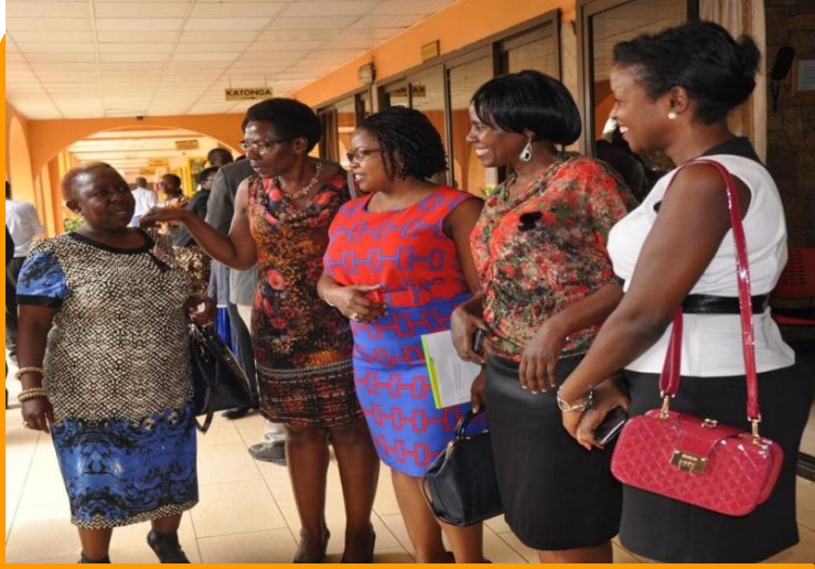
High profile guests who turned up for the project inception meeting