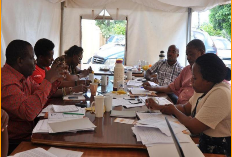
SEATINI Uganda board members in meeting

ournalists interviewing Silver Ojakol, a Commissioner from the Ministry of Trade