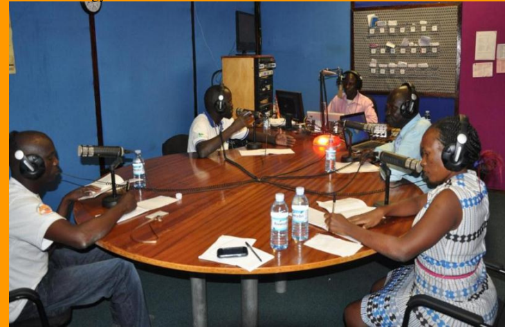
SEATINI Uganda's Financing for Development/ Tax justice Programme staff on a Radio Programme in Arua

Representatives of cultural institutions in a meeting on Biosafety and Bio-Bill 2012 in Hoima