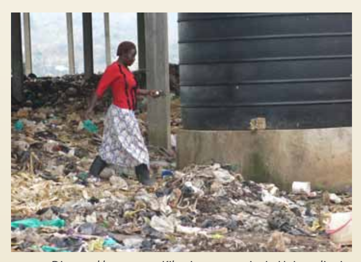
Disposed buveera at Kibati compost site in Hoima district

Burning emits toxic gases that harm the atmosphere while