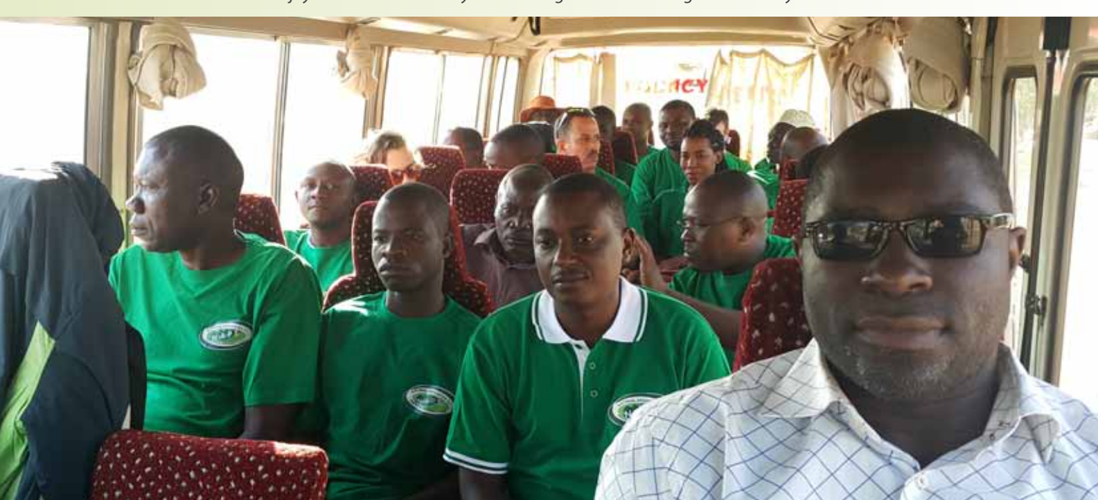
Friends of the Earth activists enjoy a bus ride on the way to the oil region in Western Uganda recently