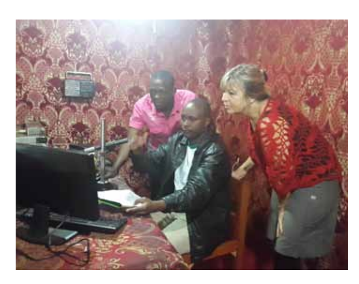
By Precious Naturinda

n April, 2015, the Community Green Radio staff received training as part of the capacity building programme designed to equip them with enough skills to run and manage a community radio.