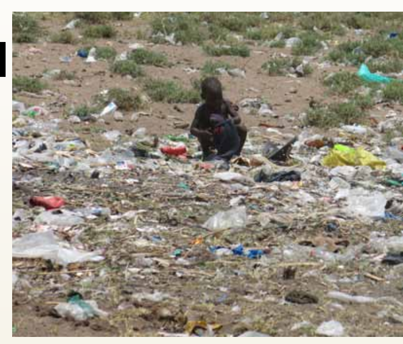
Kaveera poorly disposed in Kijangi landing site in Buseruka Sub County in Hoima District

landfills hold them indefinitely as part of the plastic waste problem throughout the globe.