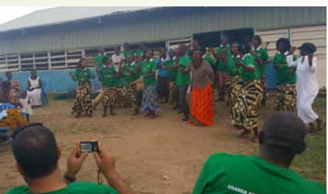
The drama group of Kaiso-Tonya Sustainability village on the shores of Lake Albert entertain visitors from Friends of the Earth on their visit to the area recently.