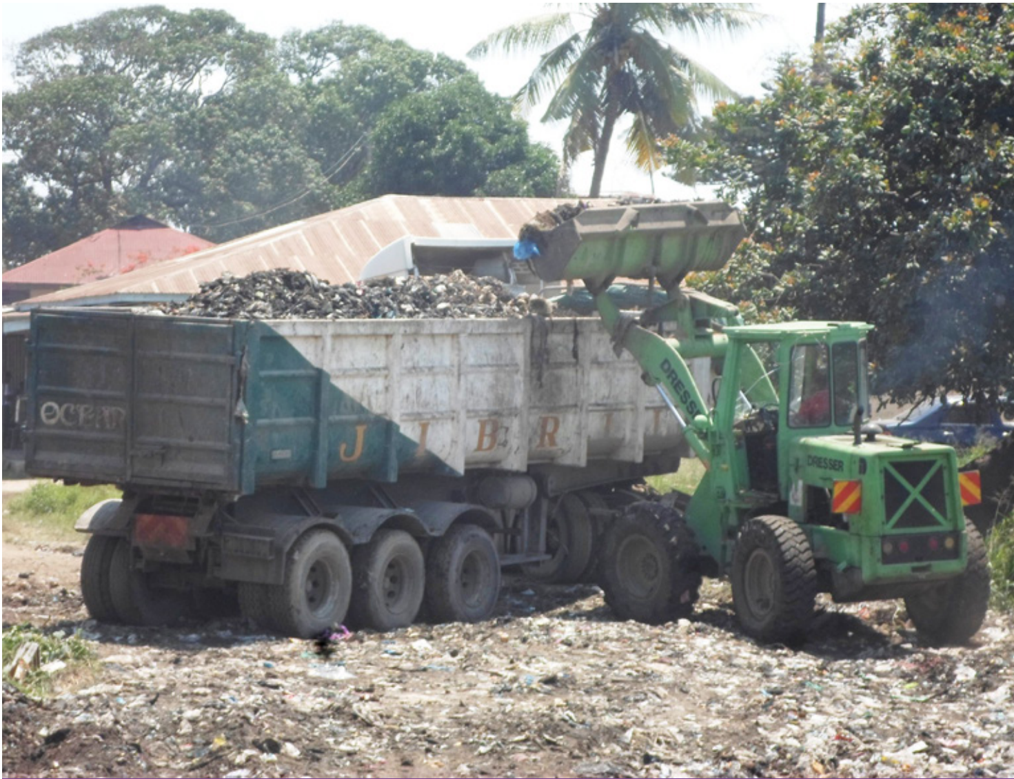
Trucks from Mombasa county collecting gabbage at Bombolulu in Kisauni

in the protection of the environment in the area would help in managing the waste. Kenya Forestry Research Institute Research (Kefri) in Coast region admits that waste management is a big challenge in many institutions. According to Chemuku Wekesa, an ecologist based in Gede, Kilifi County, they have come up with a management system by developing activities with significant impact to the environment. "We isolate those activities and based on them, we develop a management system that is specific to what we are doing and each staff has adopted and follow the system and we are able to manage our environment internally," he said.