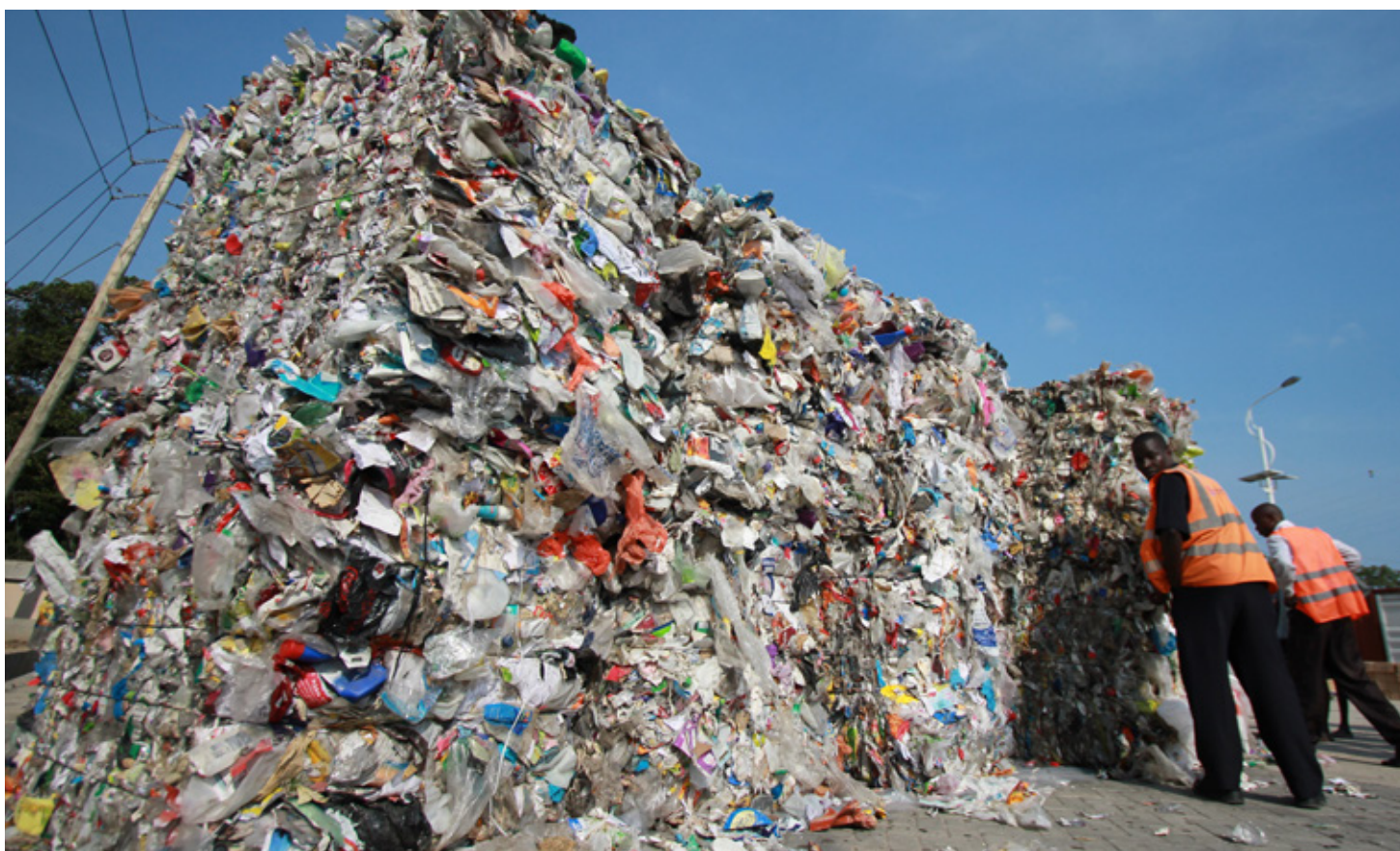
Part of the waste shipped in to Mombasa from the U.K

S olid waste management is a major problem world-over and in Kenya offers several challenges from clogged drainage and sewers, waterborne diseases like typhoid, cholera and diarrhoea, increased upper respiratory diseases from open burning of the garbage to malaria.