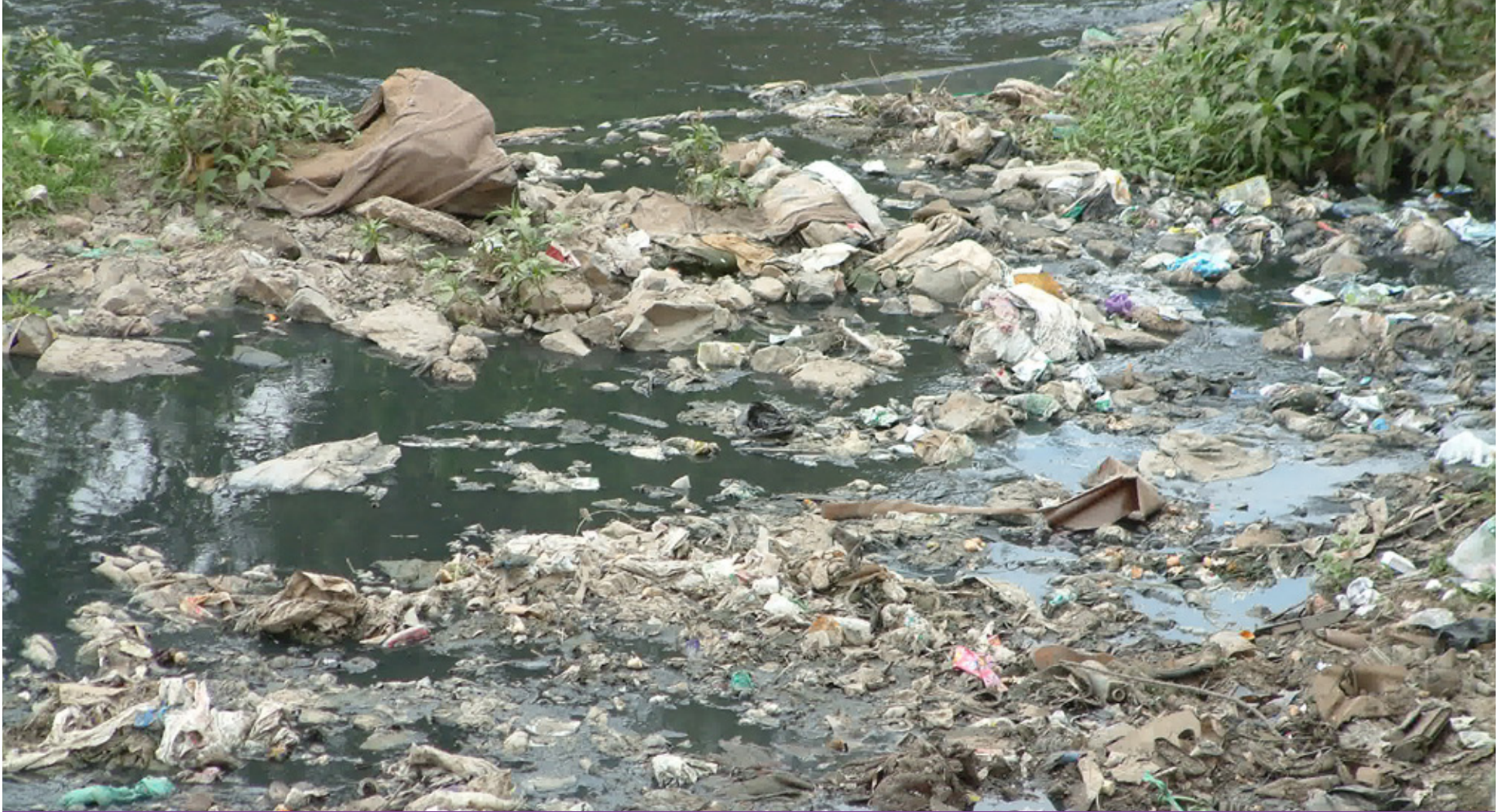
Unmanaged sewer areas in Nairobi

N airobi is one of the many cities in east Africa faced with a huge challenge on how to manage its waste. The situation is further aggravated by lack of clear ways and strategies in handling and management of waste particularly in the slum areas. With no one to turn to, the hopeless city dwellers point an accusing finger at the city council.