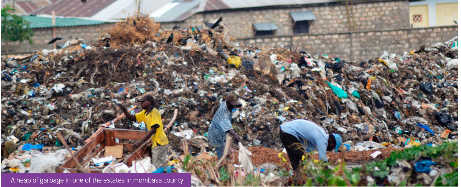
A heap of garbage in one of the estates in mombasa county