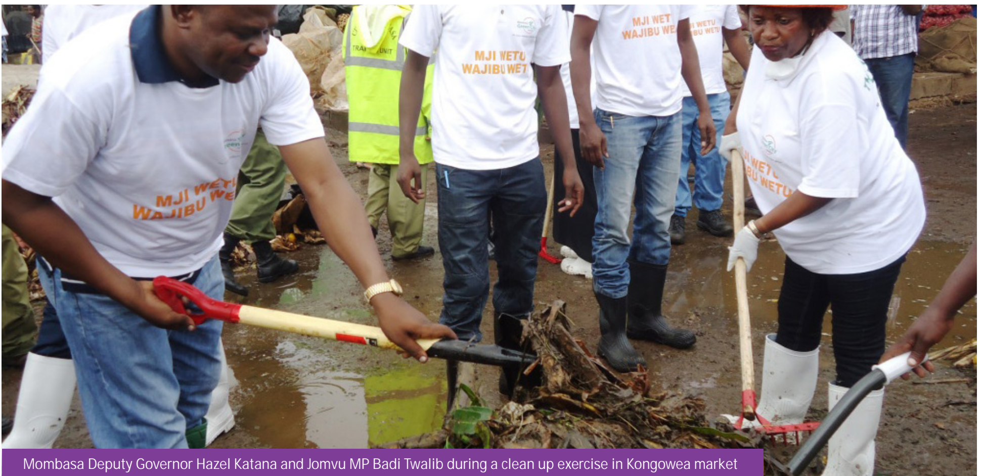
Mombasa Deputy Governor Hazel Katana and Jomvu MP Badi Twalib during a clean up exercise in Kongowea market