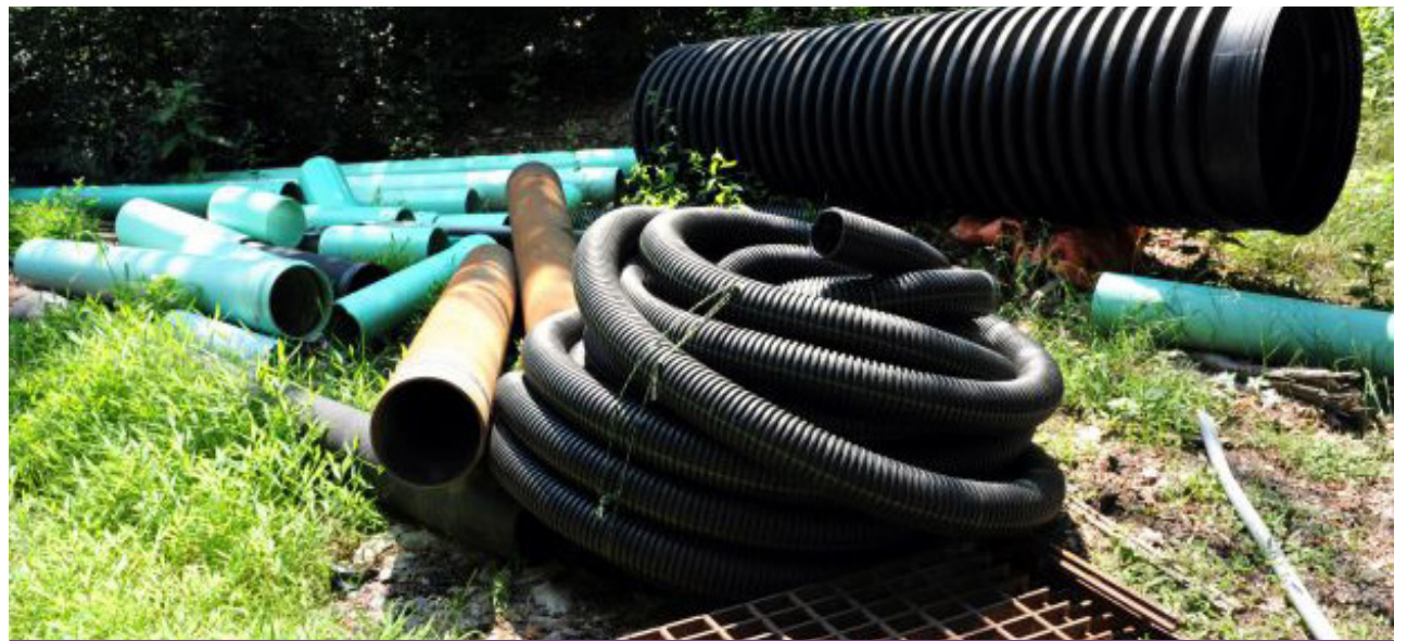
Construction material from the incomplete sewer construction project

"We have already shared a table with the County Government of Kakamega and advised them to bring stakeholders on board to come up with a law prohibiting use of plastic bags," said Ms Namayi. "The major challenge is complying with new laws but with adequate sensitization and proper involvement of all parties, especially the businesspeople, it can succeed."