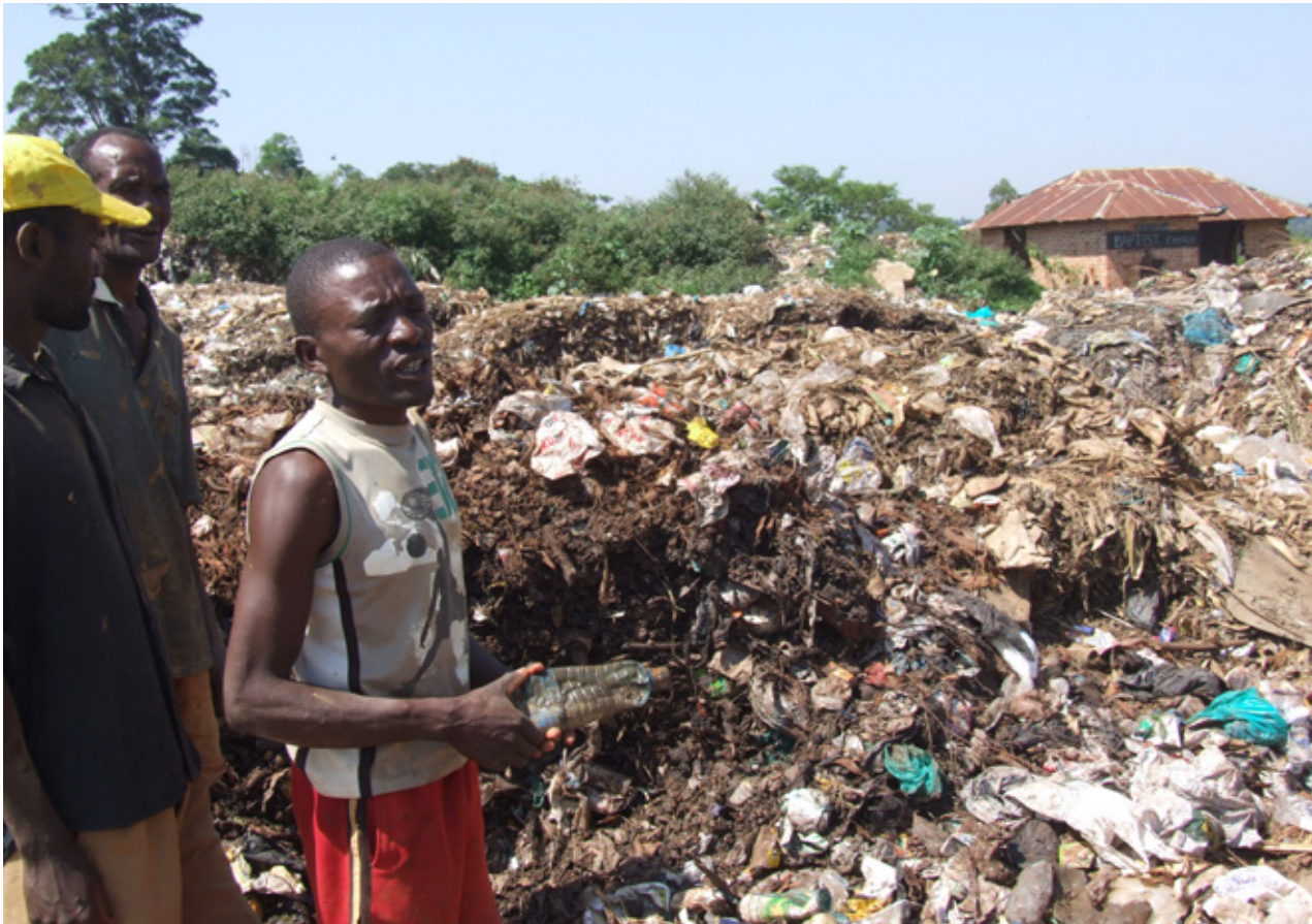
The Rosterman dumpsite in Kakamega

N o one wants a dumpsite in their vicinity, yet no one has ever stopped producing waste material, whether biologically or physically. Residents of Rosterman estate in Kakamega have never been at peace with the decision by the former local authorities to dump garbage in the area. They wish to wake up one day and find the dumpsite relocated for it is making the place inhabitable. The county government had identified an alternative dumping site on the Kakamega-Mumias Road before the owner changed his mind over the idea. The only option left is to find out how the residents can economically benefit from the waste in relation to remedying the climate change challenges. Proper waste management is important in reducing carbon emissions. Decomposition of solid waste releases methane, which is more toxic than Carbon Dioxide. The gas is also released when burning and transporting the waste.