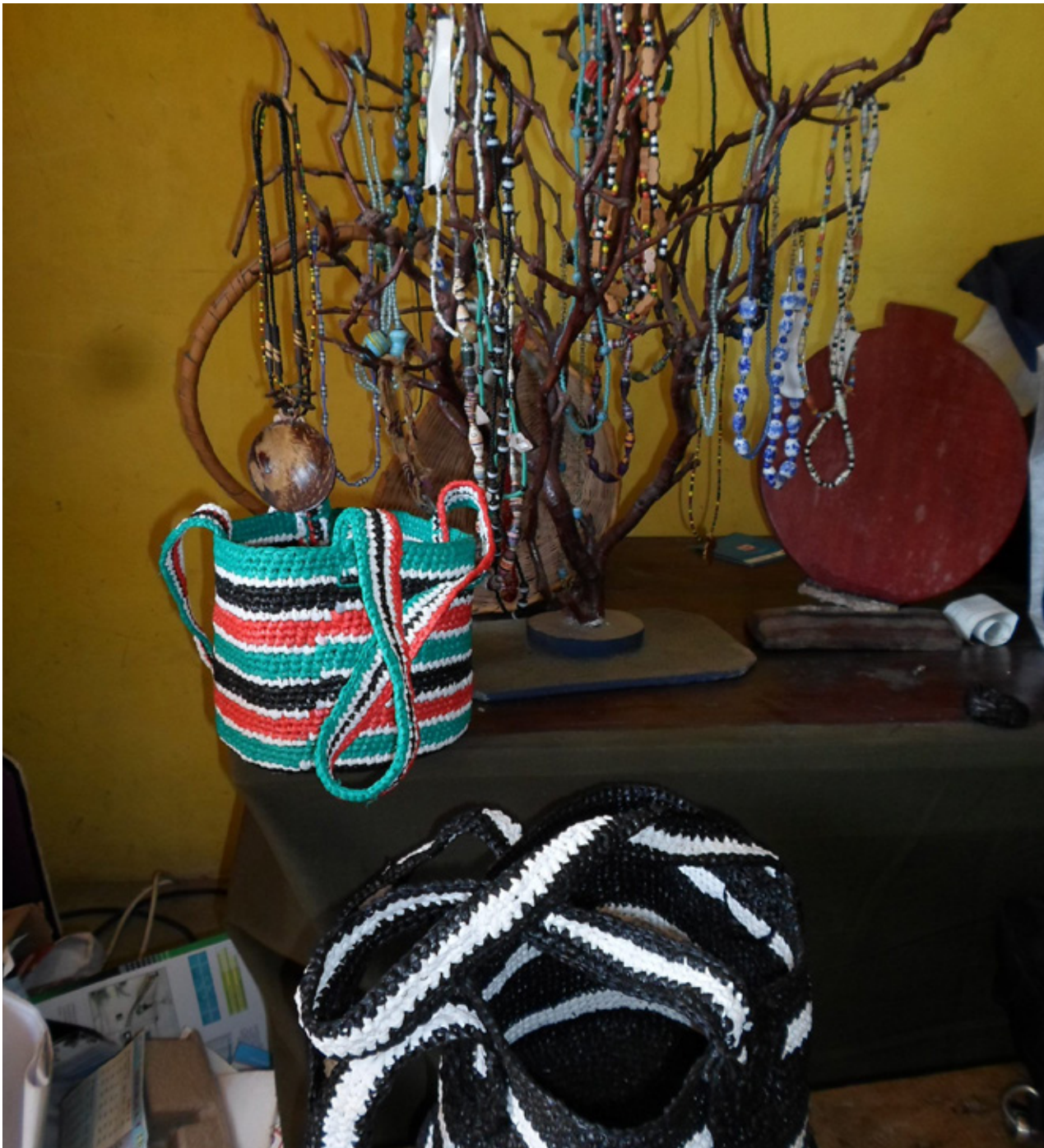
Some of products from waste plastic papers (Baskets and Necklaces) made by Tunaweza women with disability in Kisauni