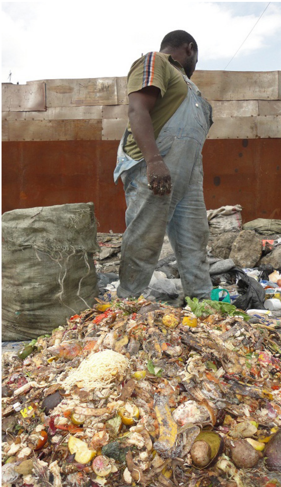
Food wastage from households in Nairobi. Most Household prepare more than they can consume and end up throwing away alot of food

Options for curbing these losses include public and private investment in market, transport and storage infrastructures, especially in developing countries. Taking these steps would help curb grain loss caused by pest and fungal infestation during storage, as well as loss of fresh produce caused by the lack of well managed and hygienic municipal market infrastructure and unavailability / inadequate cold storage facilities. There are many factors that lead to food wastage at the retailers and