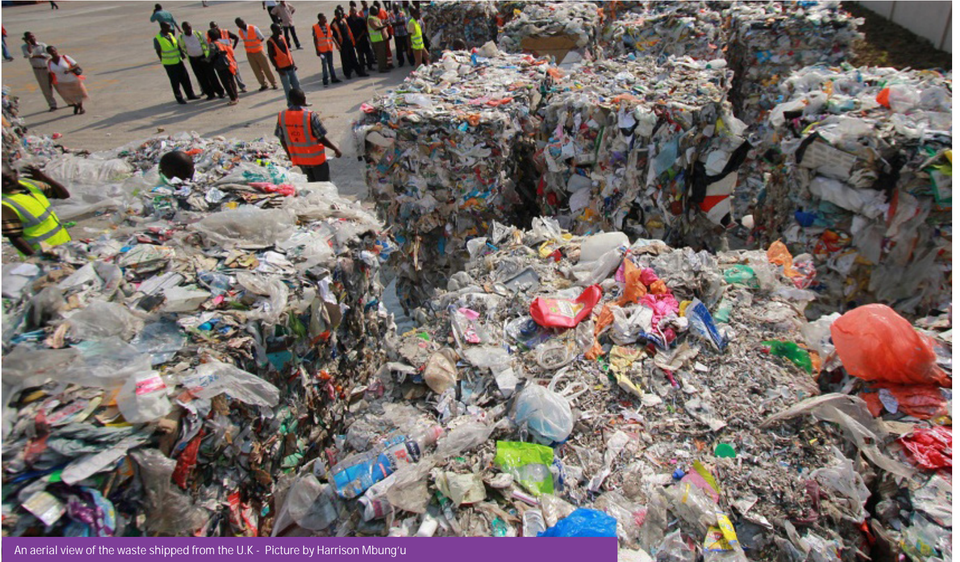
An aerial view of the waste shipped from the U.K

M ombasa County is overwhelmed by heaps of waste and garbage that are a great eye-sore at the Kibarani and Mwakirunge dumpsites and also in the central business district. Therefore, the recent shock discovery at the port of Mombasa that a container of raw garbage waste had landed into the country from the UK added more insult to injury of Mombasa's waste disposal challenge.