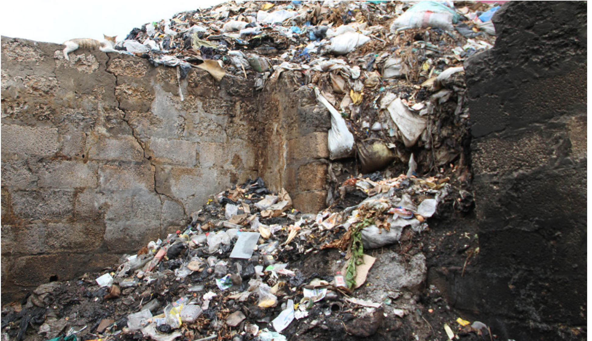
The state of garbage disposal in Mombasa

W ith a population of more than one million people, Mombasa is Kenya's second largest city after Nairobi. The country's coastal town is a key cultural and economic hub, attracting many international and local tourists. The presence of a port and an international airport has also made Mombasa one of the busiest counties in Kenya. However, just like Nairobi and other towns in Kenya, it is struggling to cope with the garbage menace.