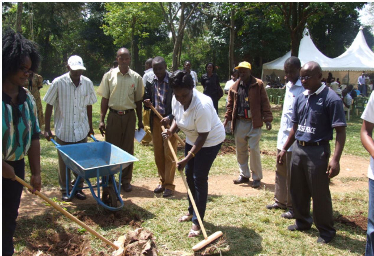
A clean up exercise in Kakamega

The County Government of Kakamega is coming up with policies to manage waste management in its major towns. The policy, which is still at puberty stage, will ensure every resident takes the responsibility of keeping the environment clean and paves the way for legal action against those who will defy.