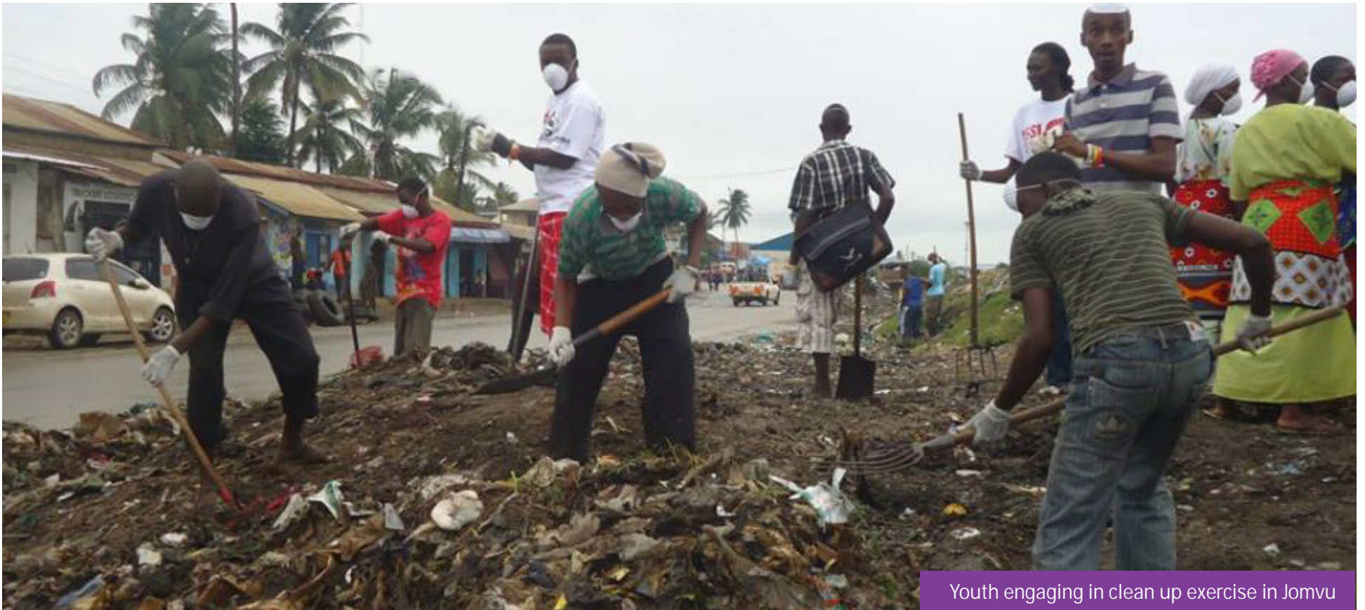
Youth engaging in clean up exercise in Jomvu