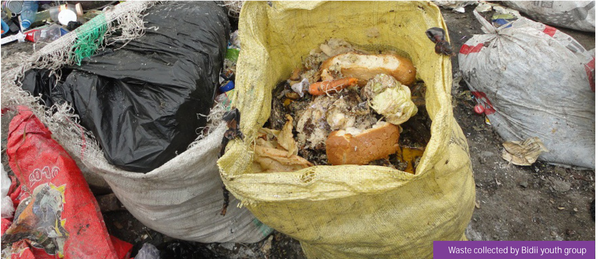
Waste collected by Bidii youth group