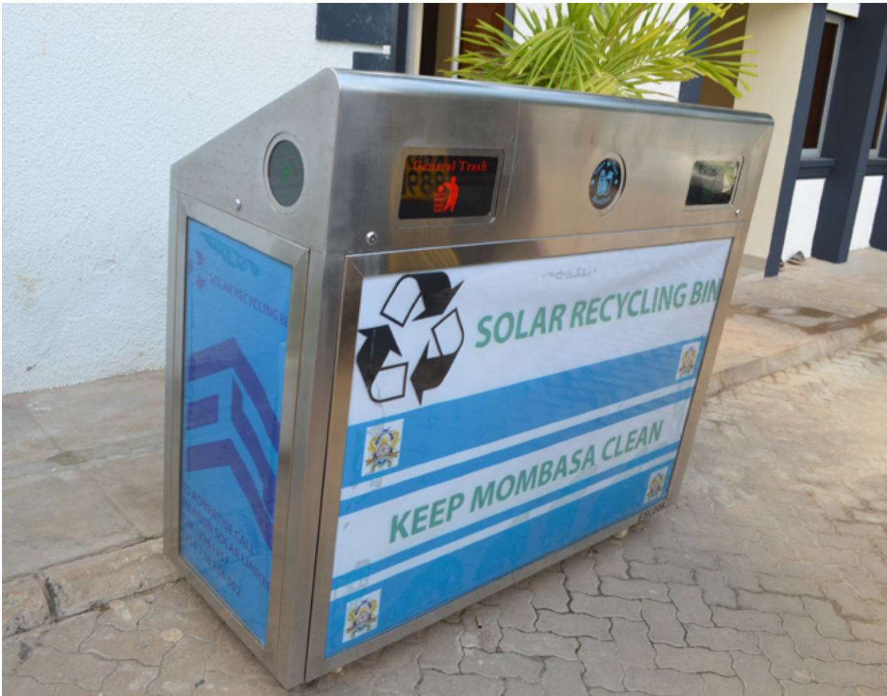
A solar recycling bin spotted in prima pest & bins company ltd at kizngo in Mombasa county

The most renowned and historic tourist destination city within Eastern Africa has been on the local and international news but this time in very negative light. Garbage and waste especially in Mombasa's central business district has media but this time on a bad representation unlike other days. This follows garbage menace even along the Central Business District.