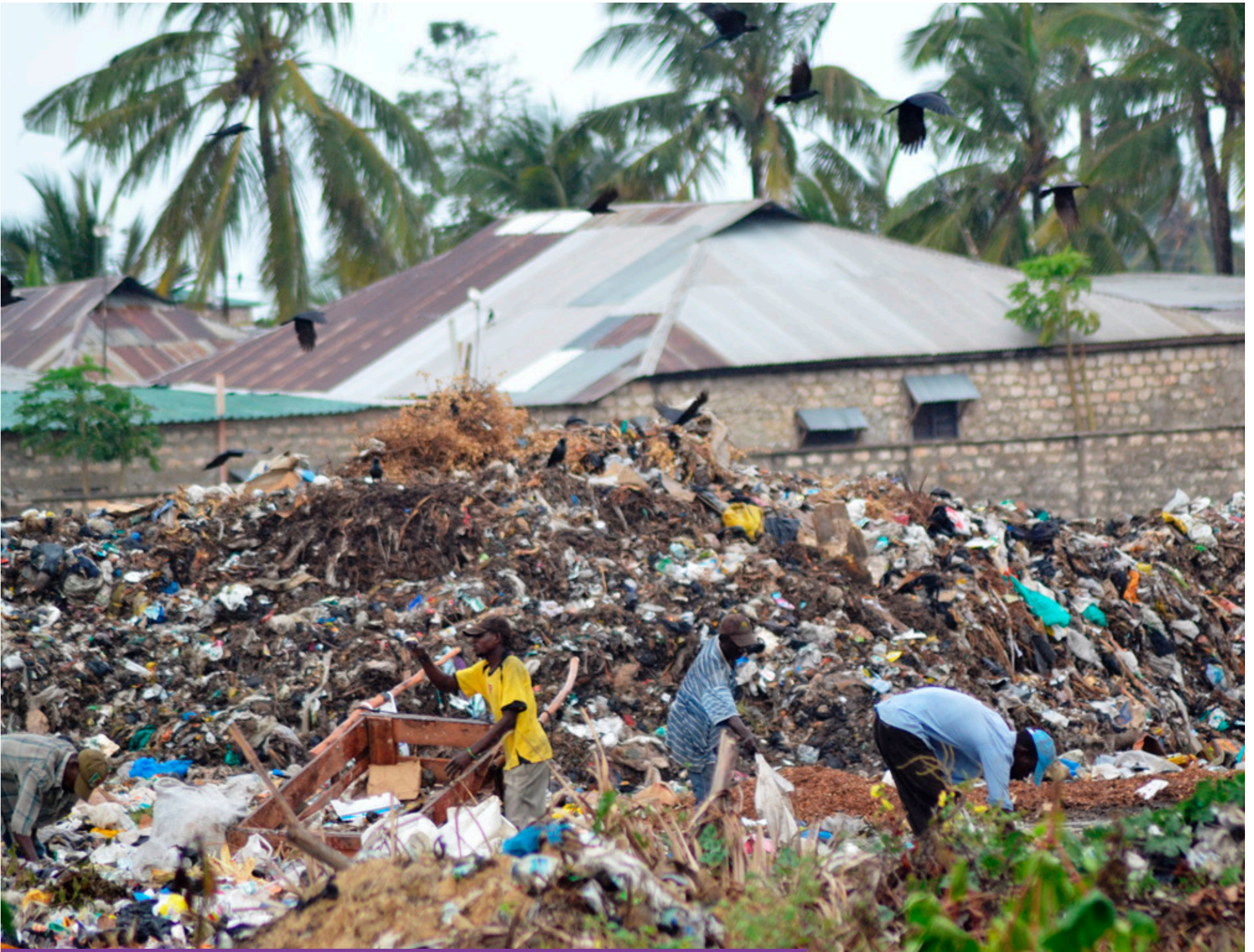
A heap of garbage in one of the estates in mombasa county.

and safety regulations when it comes to imports and exports.